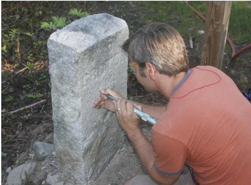
Figure 9: Milestone Restoration