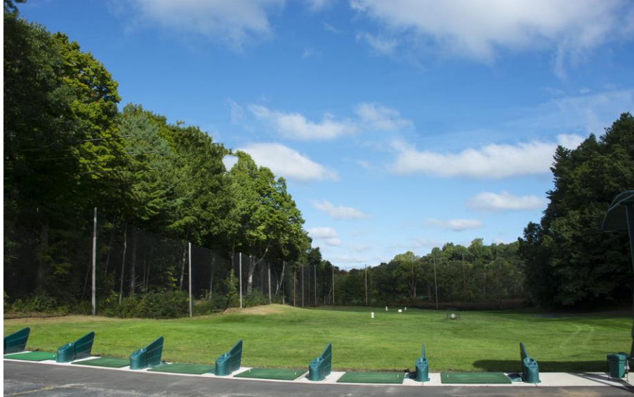
Figure 5: Country Club Driving Range Improvements

The Groton Country Club driving range (see Figure 5 ) benefits from major improvements including new poles and netting that allow any use of any club, new range mats, and a new range picking machine for improved ball retrieval. The Country Club request for $47,000 was approved at the 2015 spring Town Meeting.