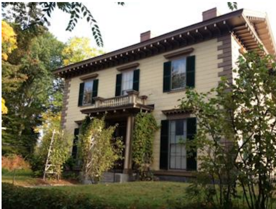
Figure 3: Boutwell House

In 2010, Boutwell house suffered two very serious water pipe failures which flooded portions of the museum's exhibition and work areas. The Board of Directors brought in several new members, wrote a long-range plan, and applied for grants. The GHS request for $176,525 was approved at the 2012 spring Town Meeting. A Cultural Facilities Fund grant for $79,000 awarded in November 2012 from the Massachusetts Cultural Council. The funding was used for physical renovations such as new wiring and plumbing, plaster replacement, a fire suppression system, and a new furnace.