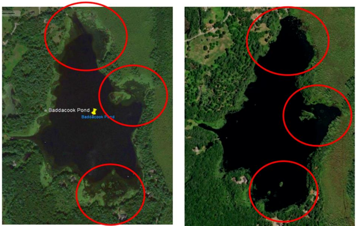
Figure 11: Baddacook Pond Restoration. Left – 2016, Right - 2019

This is the third year of a 3-year project (year 3: $140,000) to kick start Baddacook Pond restoration. This project is a joint undertaking including the Great Ponds Advisory Committee (to the Select Board), the Groton Water Department, the Weed Harvester Committee and Groton Lakes Association. The goal is: 1) to pilot control of invasive weeds. 2) to remove significant amounts of bio-mass which will substantially turn back the clock for Baddacook. When this project is completed, it will pave the way for Baddacook Pond environmental sustainability under town direction. As shown in Figure 11 , improvements have been made.