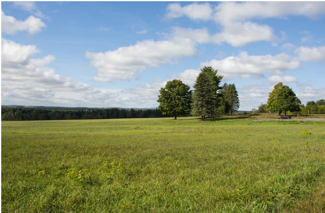
Figure 2: Surrenden Farm

The approximately 360 acres of land known as Surrenden Farm, see Figure 2 , is immediately adjacent to Groton School and is a key conservation parcel; it has extensive Nashua River frontage and is close to other large blocks of conserved land, including the Oxbow National Wildlife Refuge, Nissitissit River Wildlife Management Area, and the Groton Town Forest. The Town/Conservation Commission request for $5,600,000 was approved at the 2006 spring Town Meeting. The Town's contribution was part of the approximately $20 million required to complete the purchase. The Town's portion is financed by a multi-year bond being repaid with CPA funds.