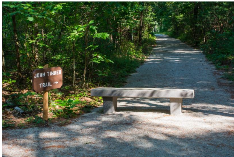
Figure 6: John Tinker Trail

Under the guidance of the Trails Committee, a new 0.22 mile, fully handicapped accessible trail was created along the Nashua River in J. Harry Rich Forest off Nod Road. It includes a parking lot and three rest viewing areas. The John Tinker Trail (see Figure 6 ) is named after Groton's founder and first selectman. The total cost of the project was $32,554. The Trail Committee request for $24,392 was approved at the 2015 spring Town Meeting. A Mass Dept. of Conservation and Recreation (DCR) grant was received, so the total CPA portion was $1,717; used to cover rental of stump grinder and buy handicap parking signs. Unexpended funds are returned to the appropriate CPC account (s).