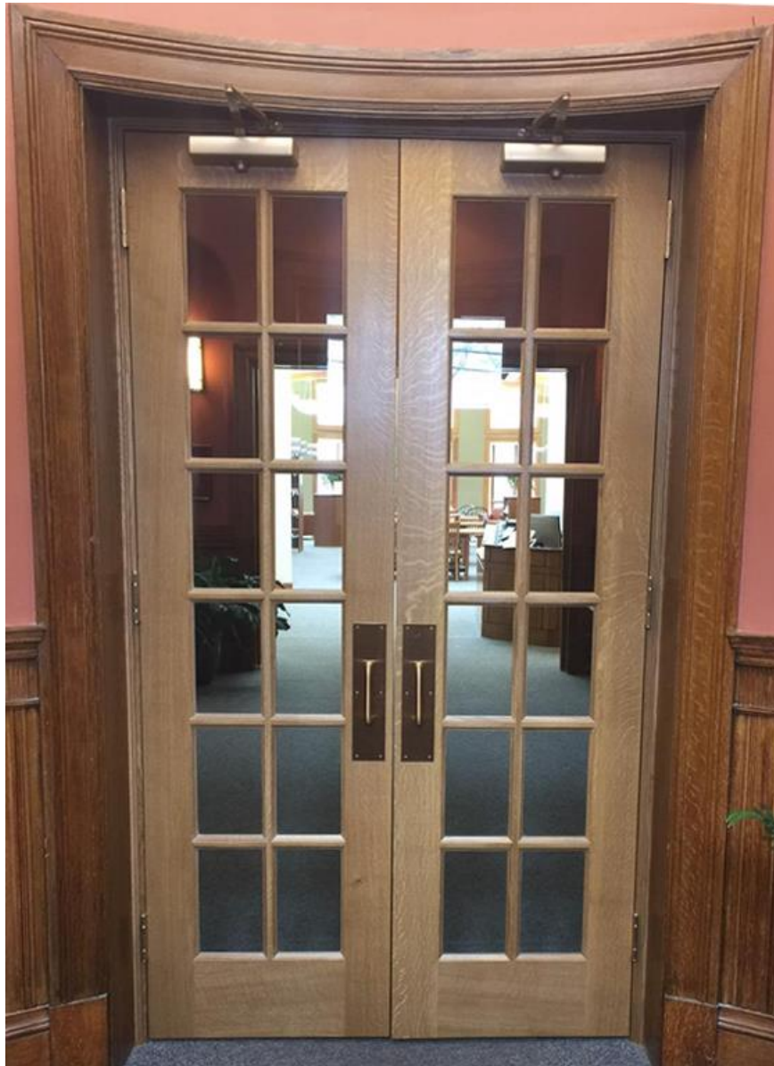
Figure 10: Library Front Entrance Restoration

The 1893 library entrance vestibule originally had a pair of interior doors, but they have been missing for decades. Without inner doors, the adjacent computer and reference areas were exposed directly to the elements and road noise whenever the Main Street door was opened. To make library users more comfortable, we needed to restore the interior doors to mitigate the spikes in temperature and noise. $15,000 was approved by the CPC for a pair of custom glass-paneled oak doors, which were crafted in the style and beauty of the historic entryway. See Figure 10 . The funding was approved at Spring Town Meeting 2017, and the project was completed in March 2018.