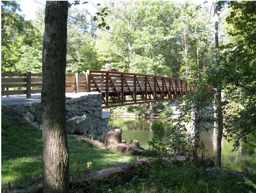
Figure 4: Fitch's Bridge

A new Fitch's Bridge (see Figure 4 ) replaced the historic and seriously deteriorated iron bridge. Fitch's Bridge is a historic connection between Groton and West Groton, with ferry and bridge links dating to the early 18 th century. The previous bridge decayed to the point where it was becoming a nuisance and safety hazard. The new bridge now connects to the Groton Trail network, linking over 70 miles of trails in Groton with over 30 miles of trails in West Groton. The Groton Greenway Committee request for $225,409 was approved at the 2013 Spring Town Meeting.