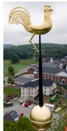
Figure 7: First Parish Restoration – Buddy Installation